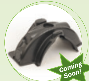
Side Port Coupler

ADS Service: ADS representatives are committed to providing you with the answers to all your questions, including specifications, and installation and more.